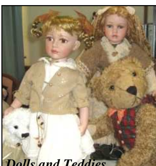
Dolls and Teddies.