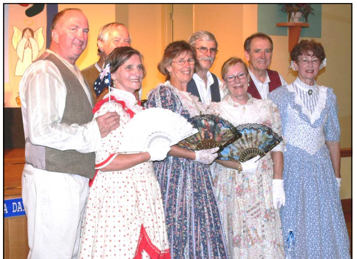
Eight members of the Wongawilli Colonial Dancers, who entertained on the evening of Australia Day in the Carrington Recreation Centre.