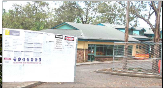
The construction site photographed on Thursday, 16th January, showing the Recreation Centre fenced off and therefore out of bounds to the general public for the duration of building.