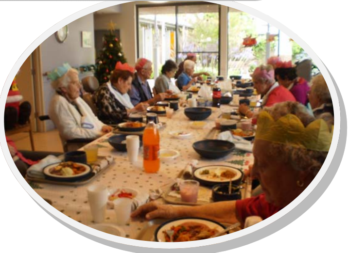
Grasmere Terrace residents enjoying Christmas lunch

We celebrated Australia Day and joined in the celebrations that occur at this time. I am sure we had a great time on this day, remembering how great our Australia is.